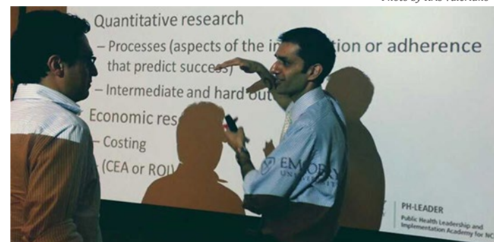
PH-LEADER Public Health Leadership and Implementation Academy for NCD